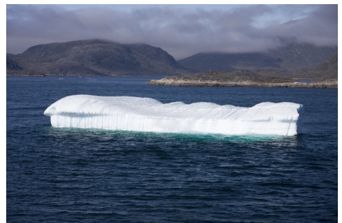
Harbor, Nanortalik, Greenland (August 15th)

Scrabble Box Score—January 7, 2010 1189 Games Played (Notice Adele's Highest Score!)