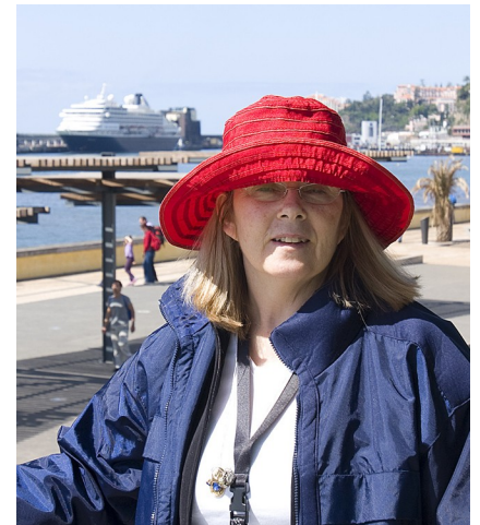
On the Beach in Funchal

Mary is still in Portland in the floating home. It is nice to know she is so close.