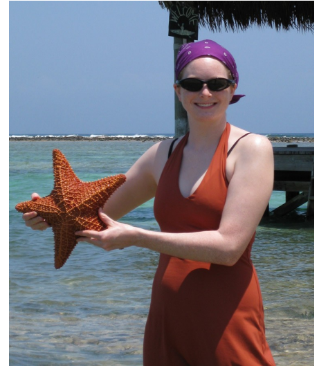
Starfish Rustler Spotted in Belize!

Now that December has come and gone, I only have two quarters left of graduate school. I've started a project with the City of Roslyn, WA (you know, where Northern Exposure was filmed) to map their human, community and social assets as they fulfill their "Roslyn Renaissance" vision. That will take the next