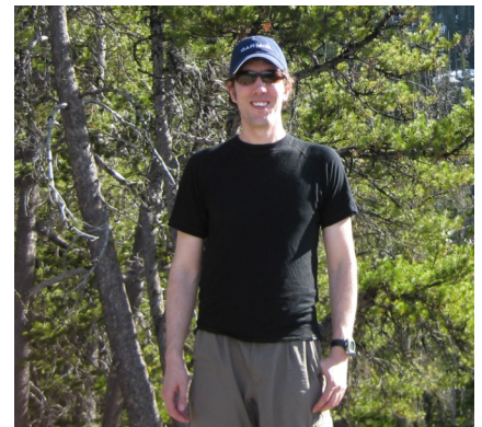
The Man Himself!

Short Gold and Treasuries - I hate gold because I can't understand why investors pay miners 3 times what it costs to destroy the environment with cyanide and strip mines. Then pay other people to guard their 'investment' until some point in the future when they hope someone will pay more to take their place. And if some bout of hyperinflation gives reason to holding gold then we should benefit even more from the shorting of Treasuries.