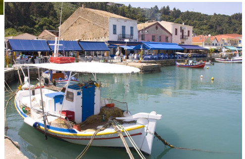
Harbor, Katakolon, Greece