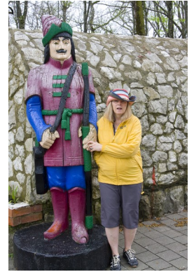
Adele Meets the Strangest People When We Travel!